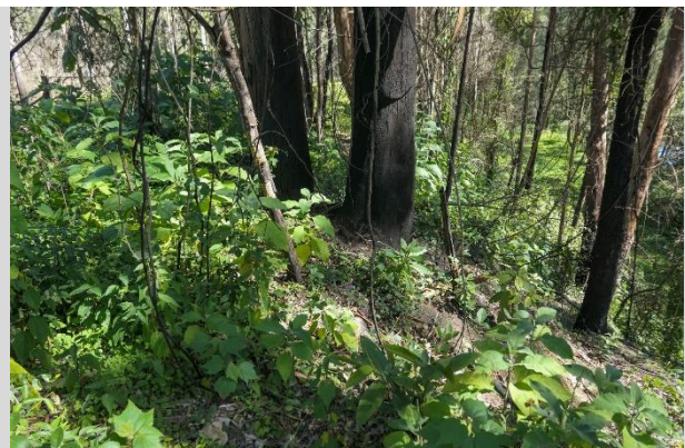
Mixed native and weed regeneration (Andy Vinter).

Weed germination is dominated by annual herbs such as Fleabane, Inkweed, and Blackberry Nightshade, and grasses. Perennial weeds like Wild Tobacco, and Lantana may also reshoot.