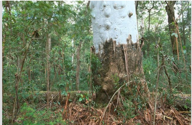
Wet Sclerophyll Forest