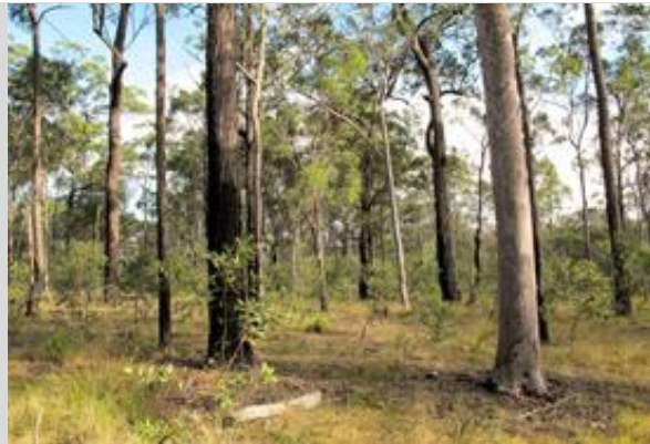
Dry Sclerophyll Forest (QLD Government)