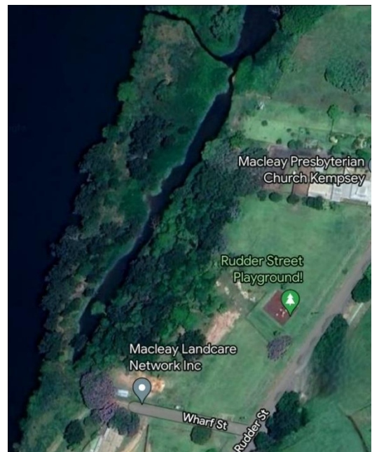
MLN Arboretum, East Kempsey